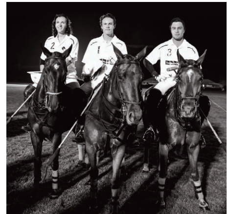
Polo at the Royal

..... Looking for THE perfect gift for the horse person in your life? Order your tickets for the Longines FEI World Cup Jumping & FEI World Cup Dressage Finals , March 29-April 2, 2017, at the CenturyLink Center in Omaha, Nebraska. VIP and series tickets are available now at www.omahaworldcup2017.com . Make the holidays memorable by giving the gift of adventure!